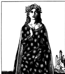
Sir Percival beholds the Lady Blanchefleur.

Now in a little after Sir Percival was come to that supper-hall the door thereof was opened and there entered several people. With these came a damsel of such extraordinary beauty and gracefulness of figure that Sir Percival stood amazed. For her face was fair beyond words; red upon white, like rose-leaves upon cream; and her eyes were bright and glancing like those of a falcon, and her nose was thin and straight, and her lips were very red, like to coral for redness, and her hair was dark and abundant and like to silk for softness. She was clad all in a dress of black, shot with stars of gold, and the dress was lined with ermine and was trimmed with sable at the collar and the cuffs and the hem thereof.