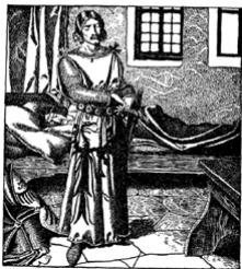
Sir Launcelot takes Sir Kay's armor.

Now before the sun arose Sir Launcelot awoke but Sir Kay still slept very soundly. Then Sir Launcelot beheld how Sir Kay slept, and he had a mind for a jest. So he clad himself in Sir Kay's armor altogether from head to foot, and he took Sir Kay's shield and spear, and he left his armor and shield and spear for Sir Kay to use. Then he went very softly from that room, and left Sir Kay still sleeping. And he took Sir Kay's horse and mounted upon it and rode away; and all that while Sir Kay knew not what had befallen, but slept very deeply.